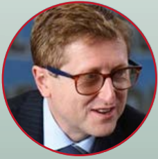
Mr [Name] – Executive Headteacher

I am looking forward to welcoming you to our school. My role is to provide a positive environment for each and every student and to ensure your every success.